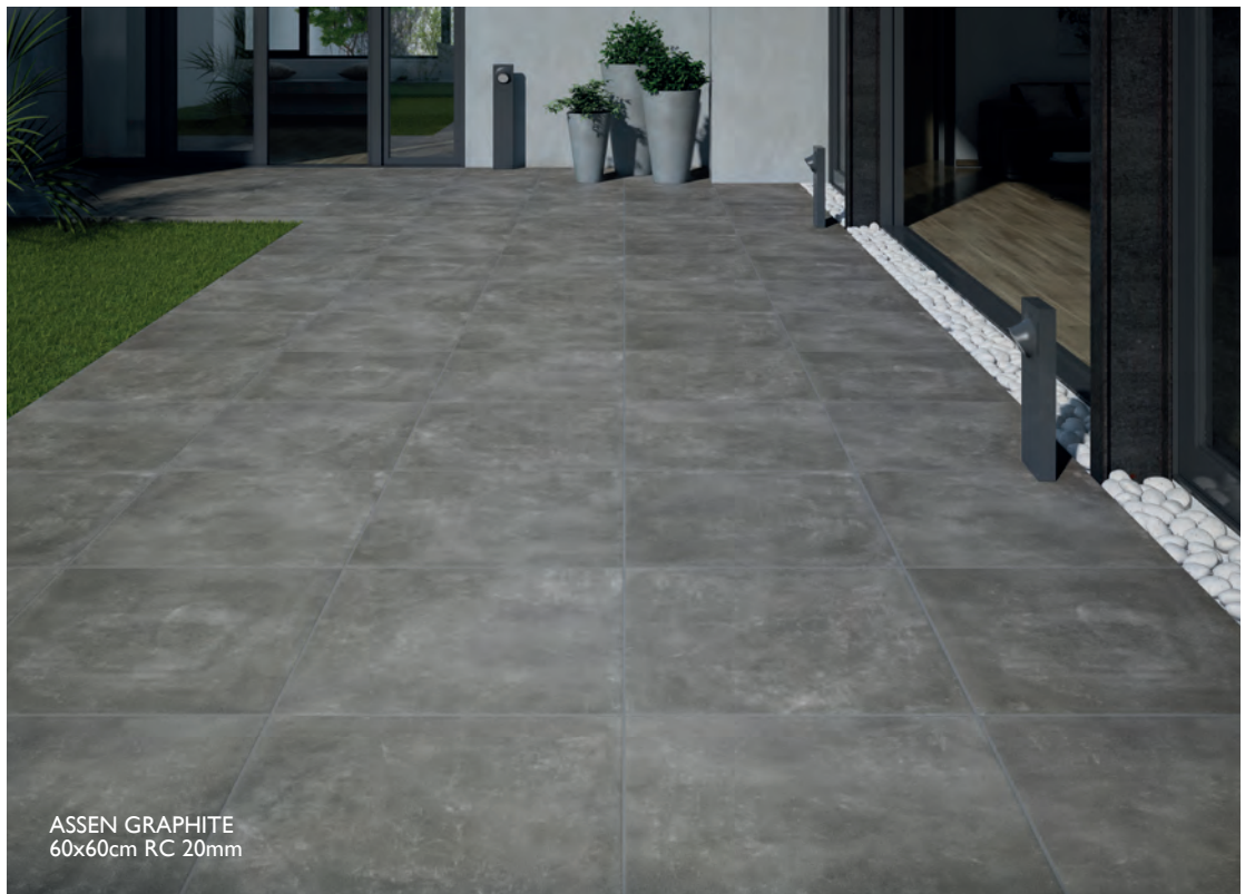
ASSEN GRAPHITE 60x60cm RC 20mm