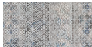
Decorado Bayaz Gris