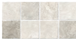
Gris Mosaic RR0203