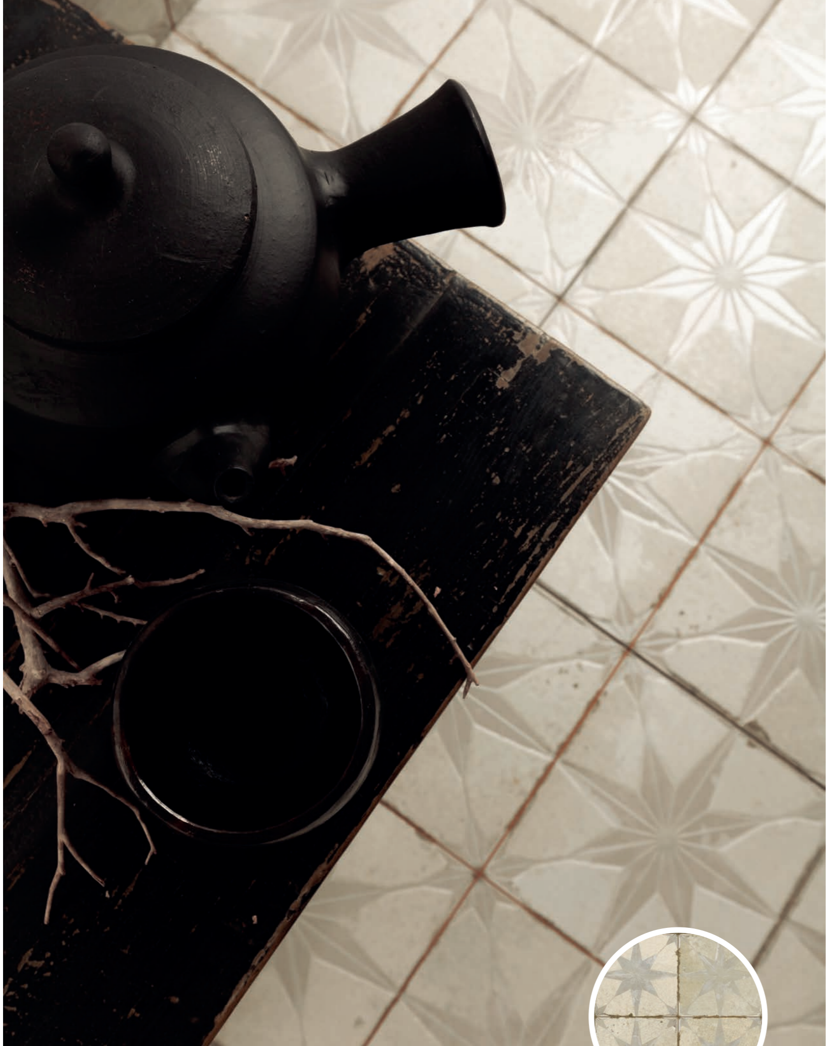
FS Star LT