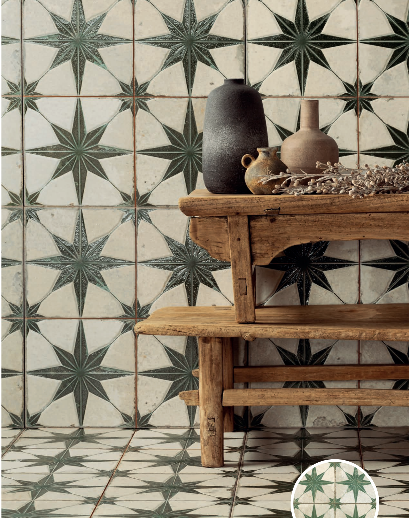
FS Star LT Sage