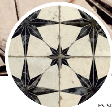
FS Star LT Black